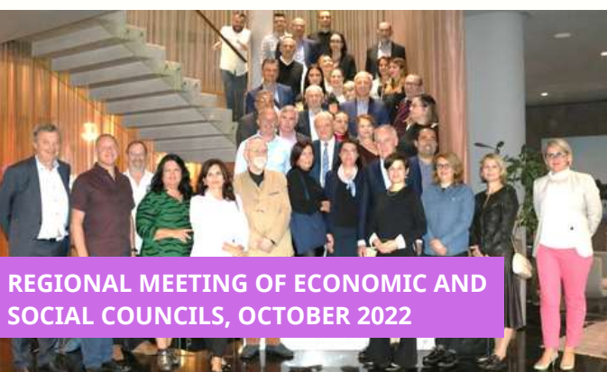
REGIONAL MEETING OF ECONOMIC AND SOCIAL COUNCILS, OCTOBER 2022